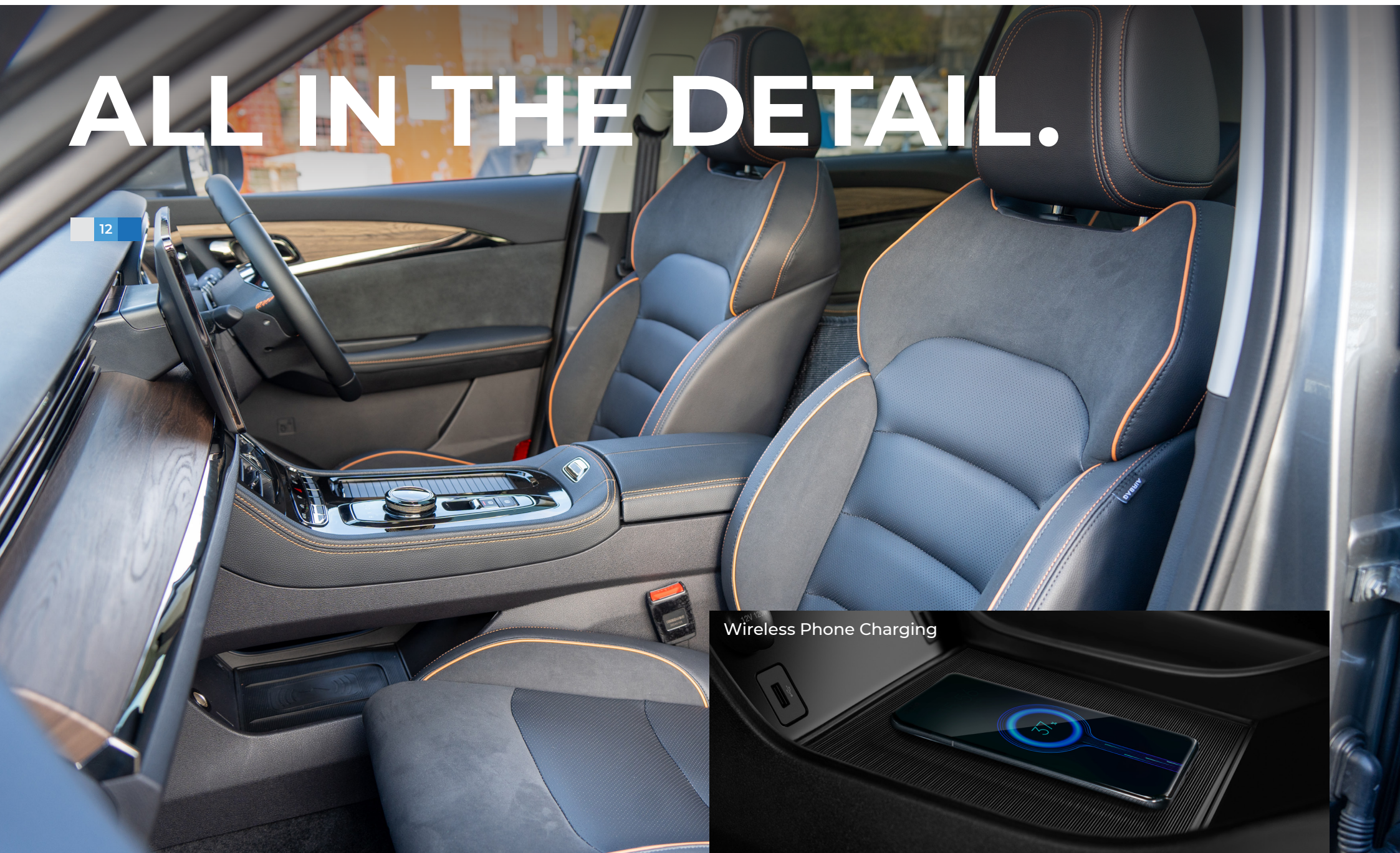
Wireless Phone Charging